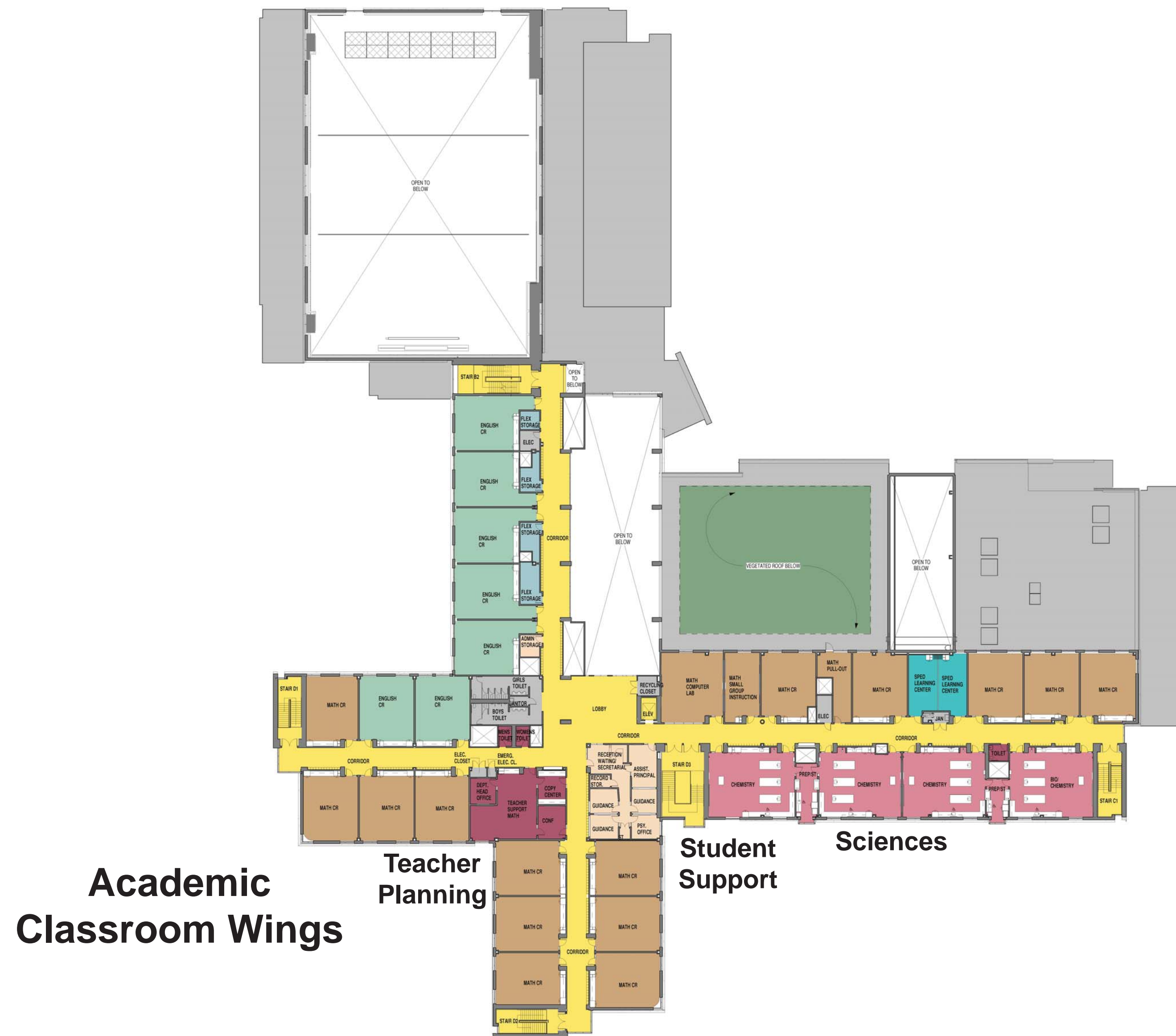
Fourth Floor Plan