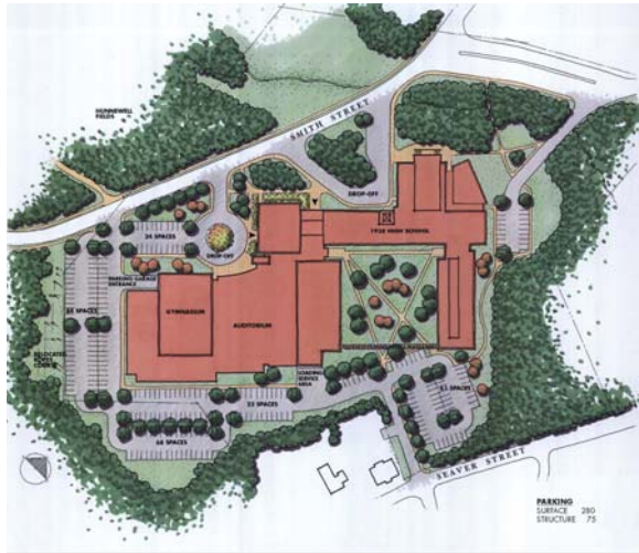
Option C 1